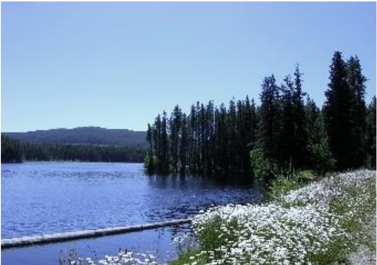
15 South Lake Reservoir