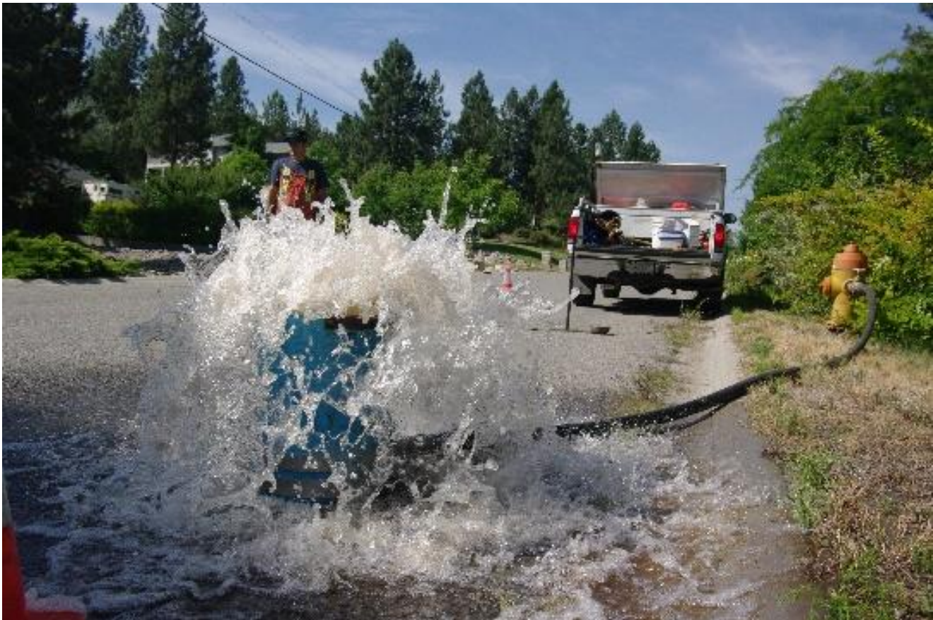
13 Flushing in Progress

Regular inspections, maintenance and water quality testing is performed by certified operators to ensure optimal operation of the GEID water systems. The district performed unilateral-directional flushing of each system in the fall of 2021 and conducted isolated area flushing as required due to maintenance, repair activities, and to maintain water quality.